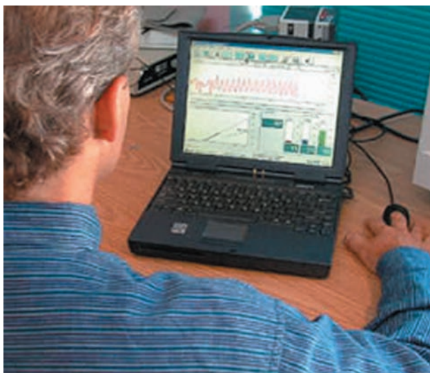
Figure 2. The Freeze-Framer® heart rhythm coherence feedback trainer.

Heart rhythm coherence feedback training is a powerful tool to help people learn to self-generate states of increased physiological coherence at will, thereby reducing stress and improving health, emotional well-being, and performance. A new HRV feedback system known as the Freeze-Framer (Quantum Intech, Inc., Boulder Creek, CA) incorporates a patented technology that enables physiological coherence to be objectively monitored and quantified. Using a fingertip or earlobe plethysmographic sensor to detect the pulse wave, this interactive hardware/software system plots changes in heart rate on a beat-to-beat basis. Both the heart rate tachogram and the HRV power spectrum can be viewed in real time. The software also includes a tutorial that provides instruction in the HeartMath positive emotion-focused coherence-building techniques. As users practice the techniques, they can readily see and experience the changes in their heart rhythm patterns, which generally become less irregular, smoother, and more sine wave-like as they enter the coherent mode. This process enables individuals to easily develop an association between a shift to a more healthful and beneficial physiological mode and the positive internal feeling experience that induces such a shift. The software also analyzes the heart rhythm patterns and calculates a coherence ratio for each session. The coherence level is fed back to the user as an accumulated